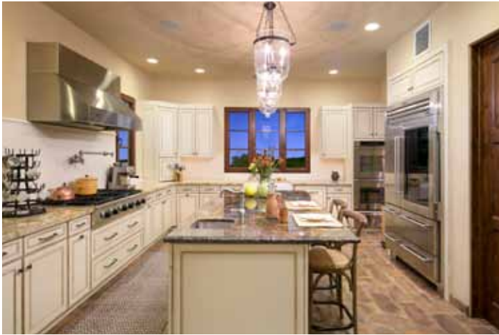
Generous chef's kitchen.