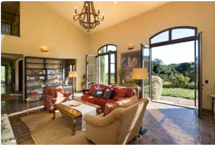
Light and airy living room.