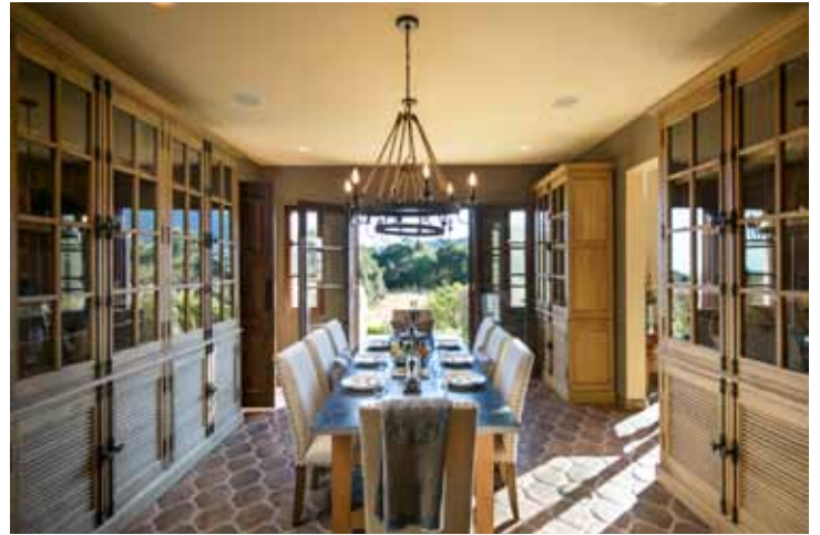
Elegant dining room.