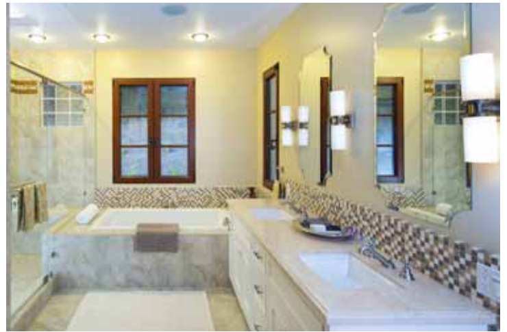
Luxurious master bath.