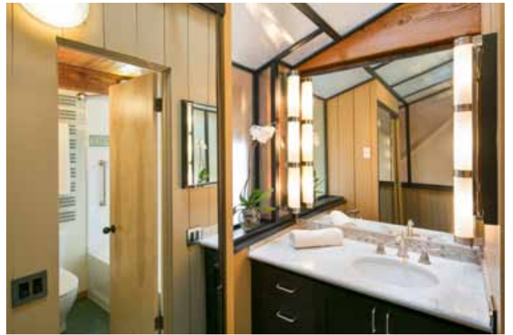
Two luxurious baths.