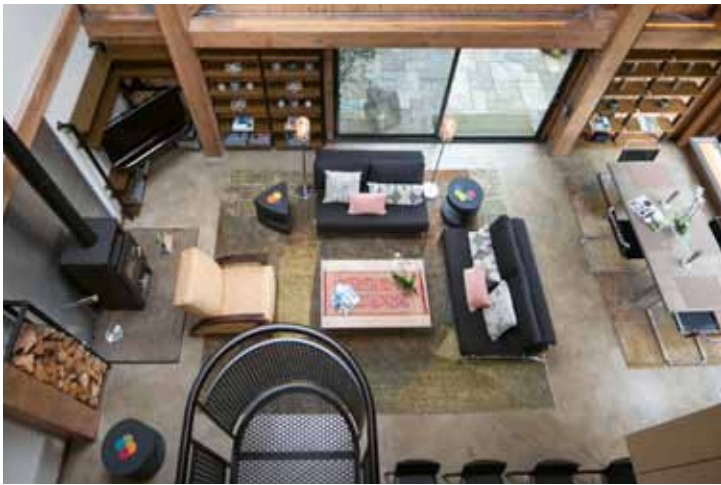
Sky high ceilings.