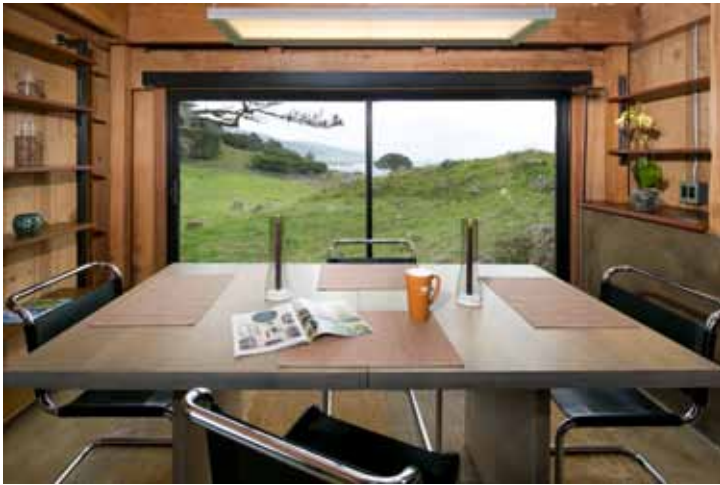
Dining area with sliding glass windows.