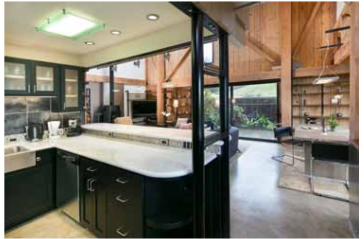
Highly functional, aesthetically pleasing kitchen.